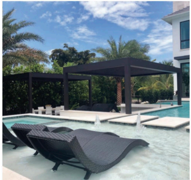
RENSON CAMARGUE SHADE STRUCTURES HAVE AUTOMATED SIDE SCREENS TO ADJUST FOR SUN, RAIN, AND WIND PROTECTION, AS WELL AS CUSTOMIZABLE FANS AND LIGHTING.

“We offer all the things that matter: options, bona fide rain protection, and shade,” says Wyatt. “The louvers are pitched to get water moving to internal gutters to prevent rain from falling on your furniture when they’re opened after it rains. You can leave furniture out when it rains, and you don’t have to wheel in an umbrella every season.”