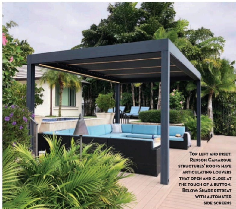
TOP LEFT AND INSET: RENSON CAMARGUE STRUCTURES' ROOFS HAVE ARTICULATING LOUVERS THAT OPEN AND CLOSE AT THE TOUCH OF A BUTTON. BELOW: SHADE RETREAT WITH AUTOMATED SIDE SCREENS